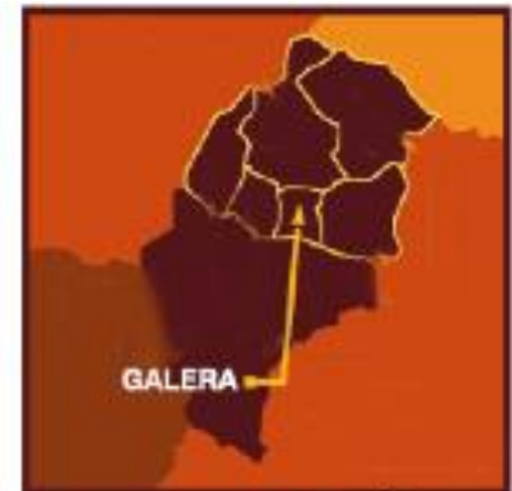
LA COMARCA DE HUÉSCAR