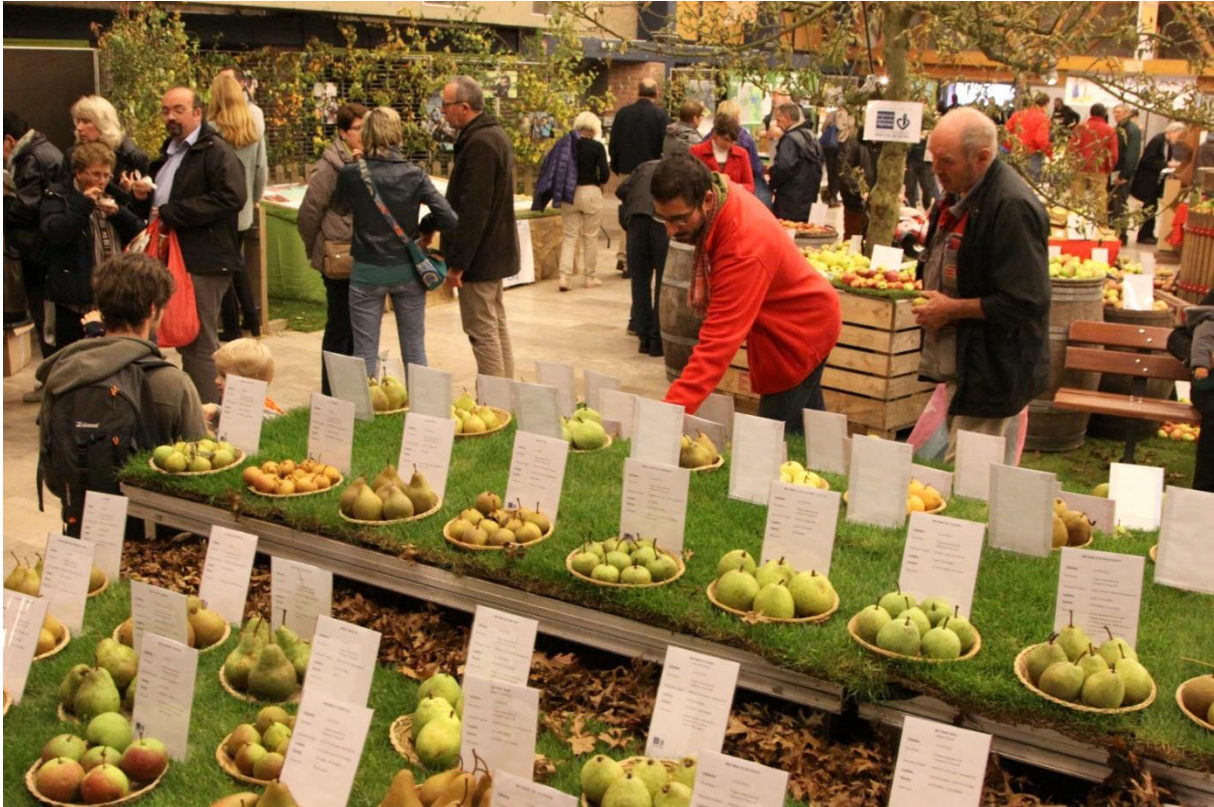
Fruit exhibit at the POMEXPO trade fair.