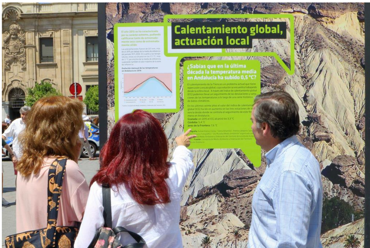
Sustainable Development Plans include dissemination activities for the population of the area.