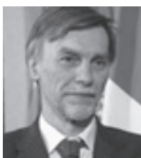
GRAZIANO DELRIO State Secretary, Prime Minister's Office (Cabinet Secretary), Italy (tbc)